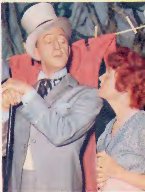
Man of parts: Ray Bolger dances with Sylvia Lewis and clowns with Betty Lynn (right) in his TV show.